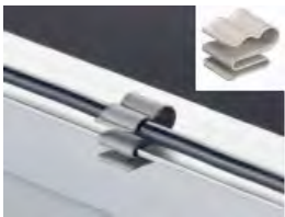
Solar Cable Clip , of steel, with corrosion protection.