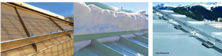
S-5!® ColorGuard is the very stable snow guard system in the colour of the roof. Mounted, also diagonally, with the S-5!® Clamps with two set screws.