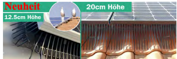
BirdBlocker, 12,5cm and 20cm high , to protect the solar installation against nesting birds.