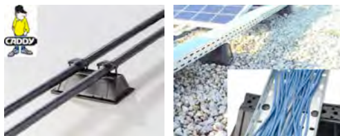
CADDY Tool-Free Flat Roof Support for professional installation of cable trays and pipes